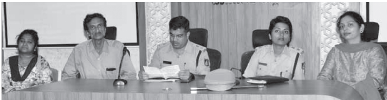
KISACON 2017 - 33rd annual state conference at Ballari 10th to 13th august 2017