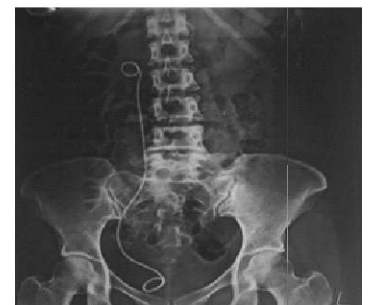
5 X-ray KUB at time of discharge